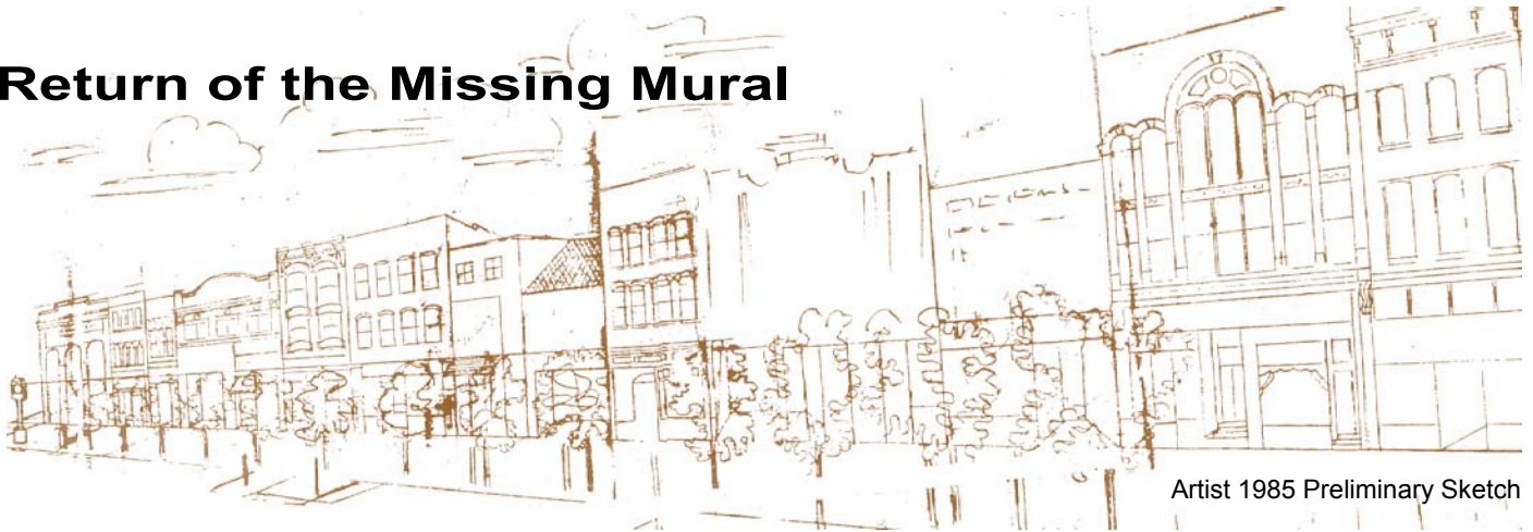
Artist 1985 Preliminary Sketch